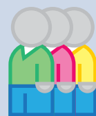
The Public and Local Stakeholders